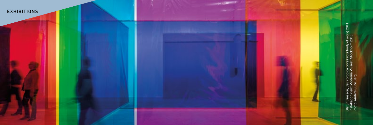
Olafur Eliasson, Seu corpo da obra (Your body of work) 2011 Installation view: Moderna Museet, Stockholm 2015